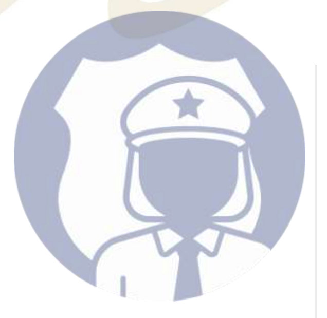
Safe & Secure Community