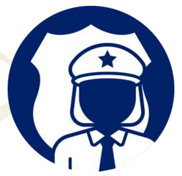
Safe & Secure Community